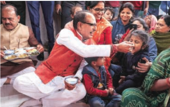
Shivraj Singh Chouhan on Tuesday said he had not been a contender for the CM chair in the past, nor was he one today

Top BJP leaders Amit Shah and J P Nadda consulted with state in-charges on Tuesday.