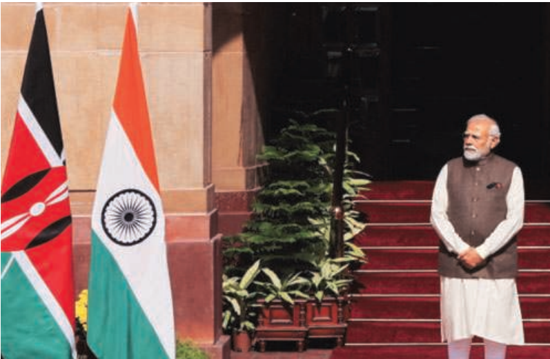
PM Narendra Modi cautioned people to be alert to the “Opposition’s divisive agenda” in a post on X. The BJP objected to a pejorative reference to the Hindi heartland by DMK in Lok Sabha

Since Sunday’s Assembly poll results, leaders of the Shiv Sena (Uddhav Balasaheb Thackeray), JD(U), Trinamool and Aam Aadmi Party (AAP) have said the Congress should be more accommodating when it comes to its regional allies. Kerala Chief Minister Pinarayi Vijayan blamed the Congress’ losses on its “greed” and unwillingness to take along its INDIA